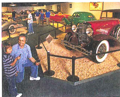
Top: About 40 miles northeast of Reno, Pyramid Lake is worth the drive. Bottom: The National Automobile Museum.

WHILE GAMING IS AS POPULAR HERE AS EVER, THIS CITY JUST OVER THE HILL FROM LAKE TAHOE ALSO BOOMS WITH ACTIVITIES BEYOND ITS CASINO STRIP. BY KIMBERLY PRYOR